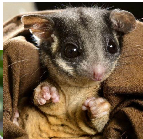
Lowland Leadbeater's Possum